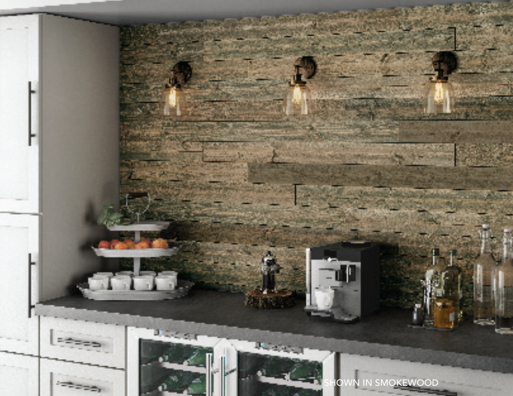
SHOWN IN SMOKEWOOD